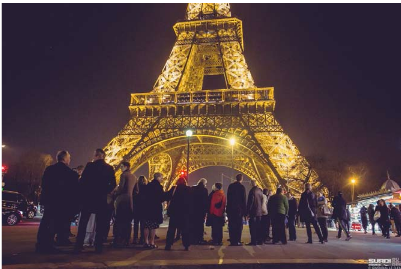
Paris by night on Friday, 1st April 2016

The event was held at the International Residence of Paris. 49 delegates and observers from 16 European countries gathered on Friday for the EFHOH AGM, followed by a dinner and a night cruise on the Seine River. Saturday was dedicated to a day of conferences, open to all, upon registration, on the theme «Living Well with hearing loss.» More than 200 people attended the event. All lectures were translated into French and English and accessible to the Hard of Hearing. Individual magnetic loops were made available to participants and simultaneous transcript was streamed on two displays, in English and French.