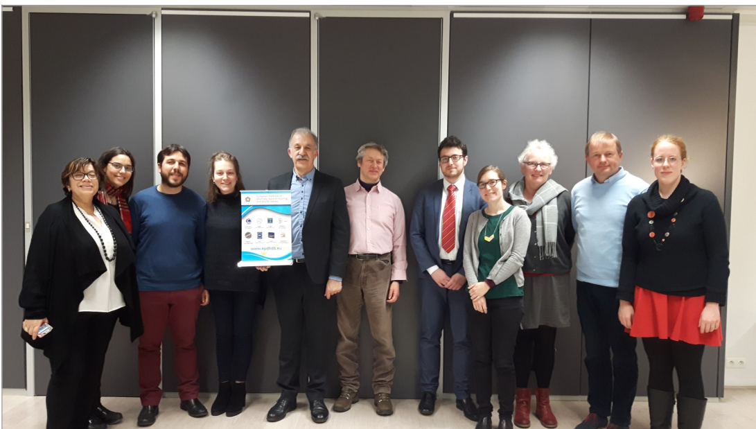
Photo of Platform members meeting

European Platform of Deafness, Hard of Hearing, and Deafblindness