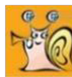
IFHOHYP International Federation of Hard of Hearing Young People